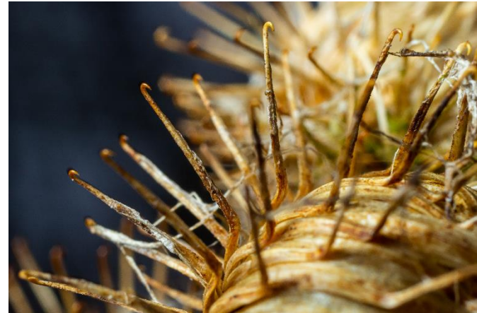
Note the small hooks on the spines.

Georges de Mestral invented the Velcro inspired by the properties of burdock plants. He was out walking in the Swiss mountains with his dog. Seeds got stuck in the dog's fur. The hooked seeds of the burdock plant easily gets stuck in an animal's fur. This means that seeds can be moved from one place to another and thus disperse its seed. Velcro straps that you find in clothing or shoes are usually made of nylon. Today however, innovators strive to use durable materials.